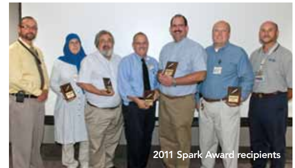
2011 Spark Award recipients