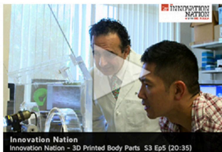
[Video] CBS The Henry Ford's Innovation Nation with Mo Rocca Visits WFIRM