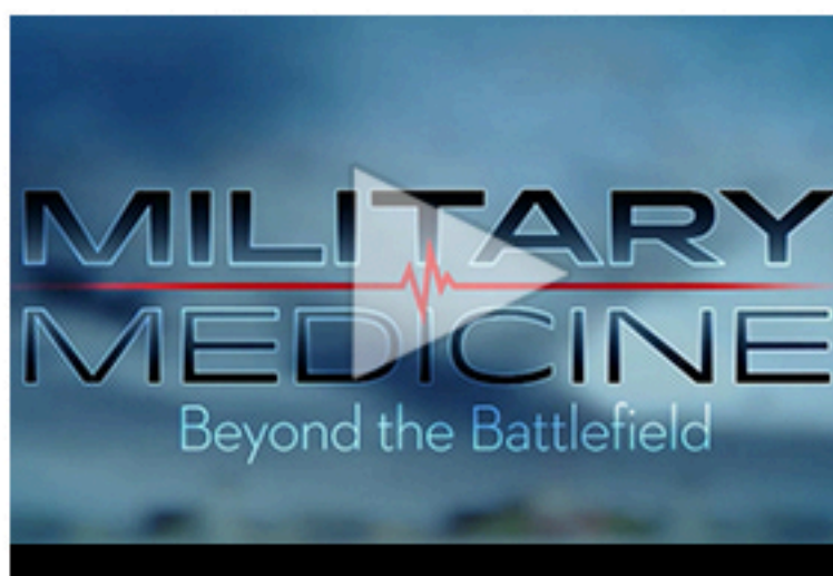
[Video] PBS Military Medicine: Beyond the Battlefield with Bob Woodruff

Save The Date: Summer Scholars Program 2017