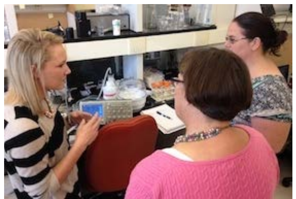
North Carolina New Schools Teacher Externs Blog About WFIRM Experience