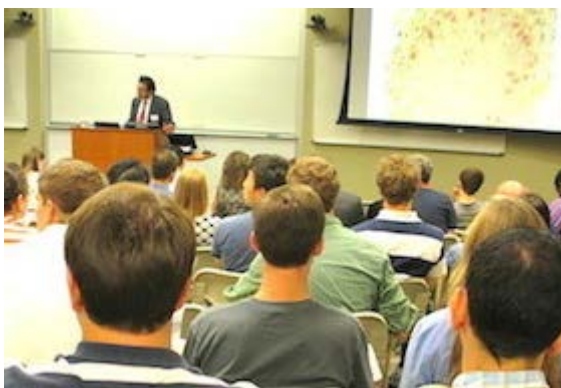
Regenerative Medicine Essentials Attended by Participants Worldwide