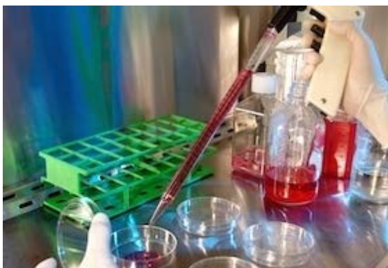
Researcher Working to Develop Cell- Therapy Product to Treat Diabetes