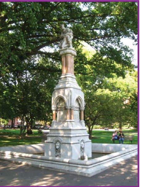
The Ether monument commemorates the use of ether in anesthesia. The oldest monument in the Public Garden, the statue/fountain is located near the intersection of Marlborough and Arlington Streets in the NW corner of the Garden.