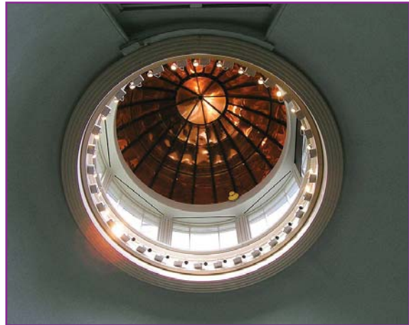
The Ether Dome at the Bulfinch Building at Massachusetts General Hospital. The Dome viewed from inside the surgical theatre that was the site of the first public demonstration of the use of inhaled ether as a surgical anesthetic on October 16, 1846.