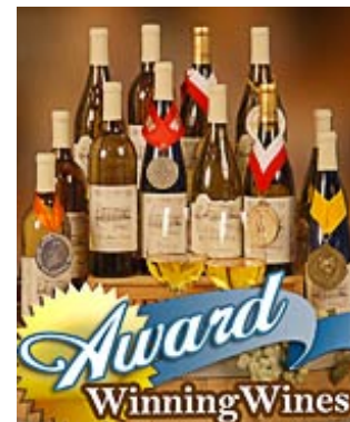
West Bend Vineyards, Lewisville, NC

Please indicate your interest on the registration form for any events you wish to attend.