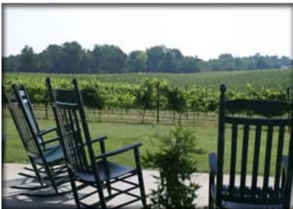
RayLen Vineyards, Mocksville, NC

Forsyth County and the Yadkin River area have made a very successful transition from tobacco to grapes. The region is home to several vineyards producing quality wines. Perhaps you would like to sample the local vintages? Plan to attend a tasting at RayLen Vineyards and West Bend Vineyards on Saturday afternoon.