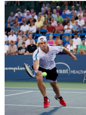
Andy Roddick W-S Open 2011