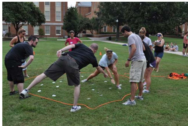
Students participate in a team-building exercise during the “Surviving the Bubble” orientation.

tion that were both directly tested during her interview day were things she learned from attending H 3 A, and she commented that she had lots of confidence in her preparation because of the entire experience at our conference.