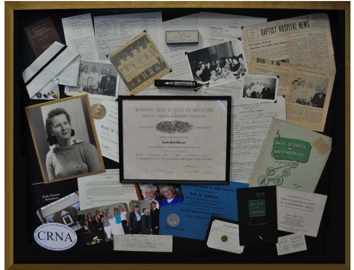
The Ruth Holleman Memorial, displaying mementos of her education and career.