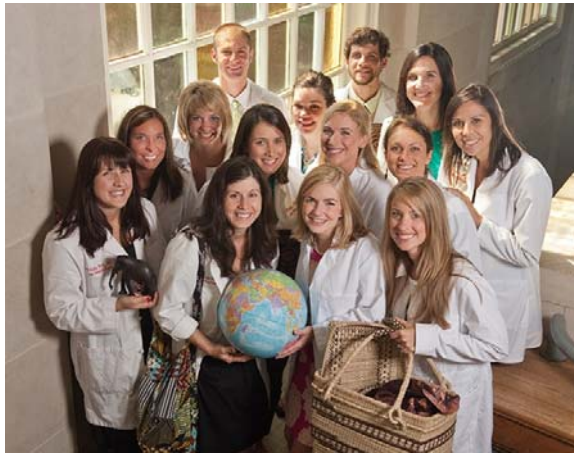
Students from the Class of 2011 who participated in global health learning opportunities.