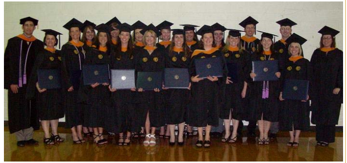
Class of 2010 MSN Graduation photo