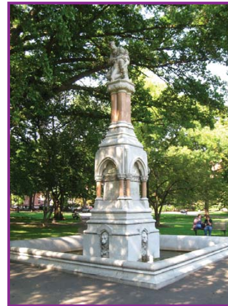
The Ether monument commemorates the use of ether in anesthesia. The oldest monument in the Public Garden, the statue/fountain is located near the intersection of Marlborough and Arlington Streets in the NW corner of the Garden.