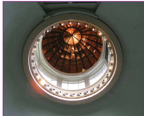
The Ether Dome at the Bulfinch Building at Massachusetts General Hospital. The Dome viewed from inside the surgical theatre that was the site of the first public demonstration of the use of inhaled ether as a surgical anesthetic on October 16, 1846.